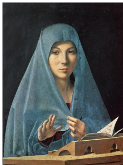
Antonello da Messina, L'Annunciata

Jesus said to his disciples: 'There will be signs in the sun, the moon, and the stars, and on the earth distress among nations confused... People will faint from fear and foreboding of what is coming upon the world... Then they will see "the Son of Man coming..." (Luke chapt 21)